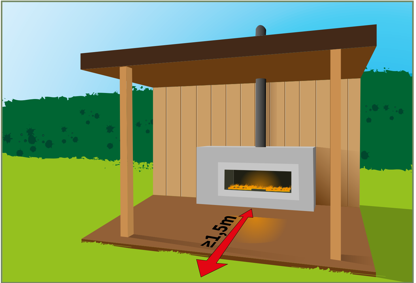
Figure 1 - Minimal dimensions for overhang with outdoor fires